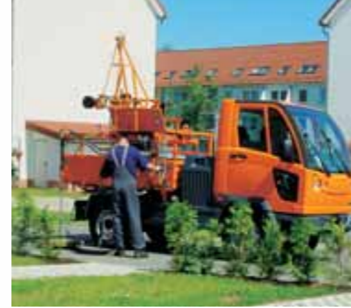
Lifting of sewer cover and hydraulic cleaning of catch basin. With FUMO, you are quickly ready to start.

Especially for the tasks that do not have to be performed every day, you will discover the many talents of the Multicar family. Via the hydraulic connections at the front and rear you drive, for example, many implements for repair and maintenance completely independent of stationary current sources. The attachment ball & socket quick-change system is your docking system for nearly a hundred possible special attachments. In addition, the many transporter attachments again supplement the spectrum decisively.