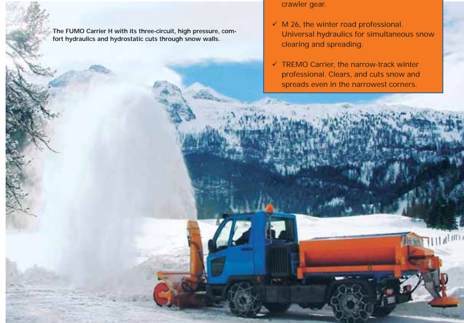
The FUMO Carrier H with its three-circuit, high pressure, comfort hydraulics and hydrostatic cuts through snow walls.