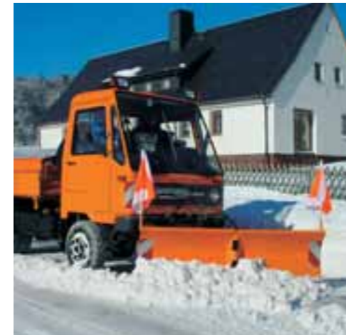
The M 26 with universal hydraulics pushes itself through snow and ice.

Even when it becomes cold outside, it is warm and comfortable in the modern space-frame cab of the FUMO.