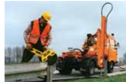
The M 26's generator supplies current for operating equipment (e.g. capping saw and bolt-driver).