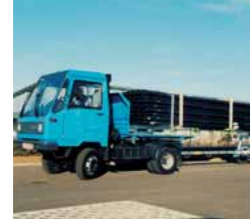
Only 1.59 m wide, 2.24 m high, but up to 8 m long. The M 26 with longmaterial dolly.