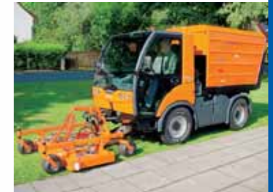
The TREMO implement carrier with commercial grass and leaf collection system.