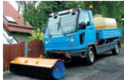
FUMO, outfitted for cleaning, brings 60 l/min onto the road with the 140 bar spraying bar.