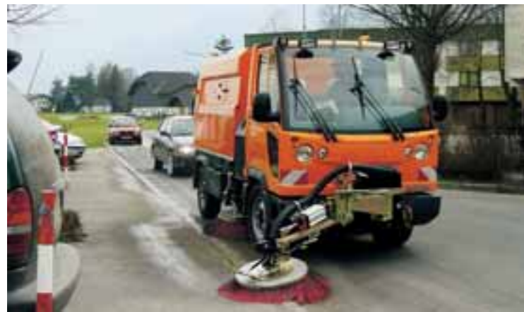
With an operating pressure of up to 300 bar, you control the volume flow for the suction road cleaning machine comfortably from the centre console.