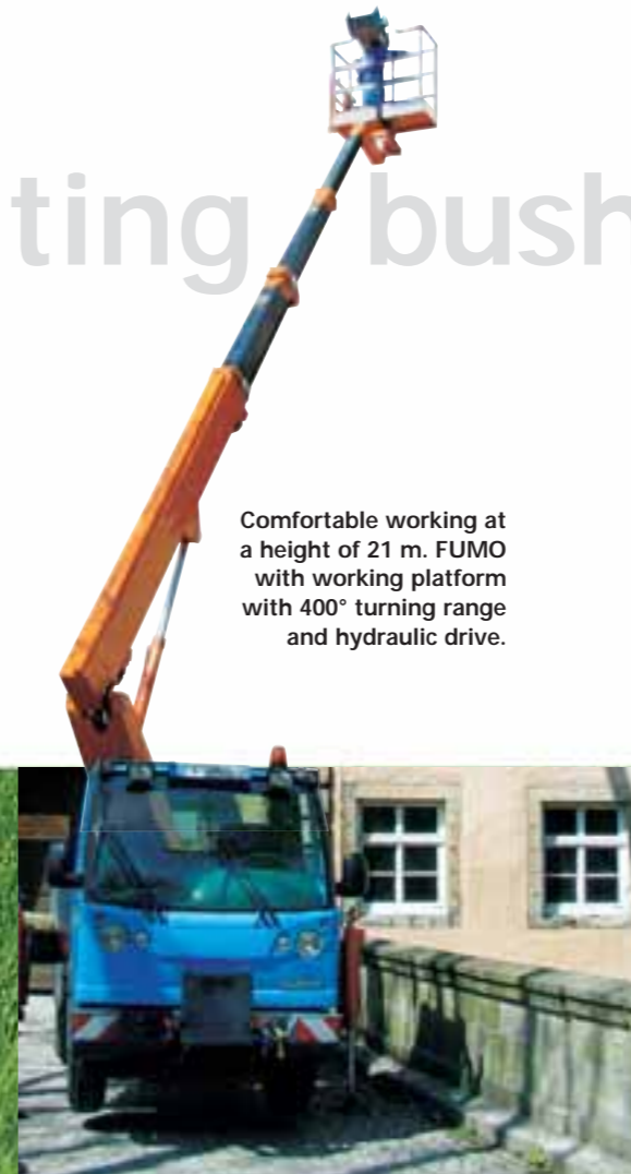
Comfortable working at a height of 21 m. FUMO with working platform with 400° turning range and hydraulic drive.