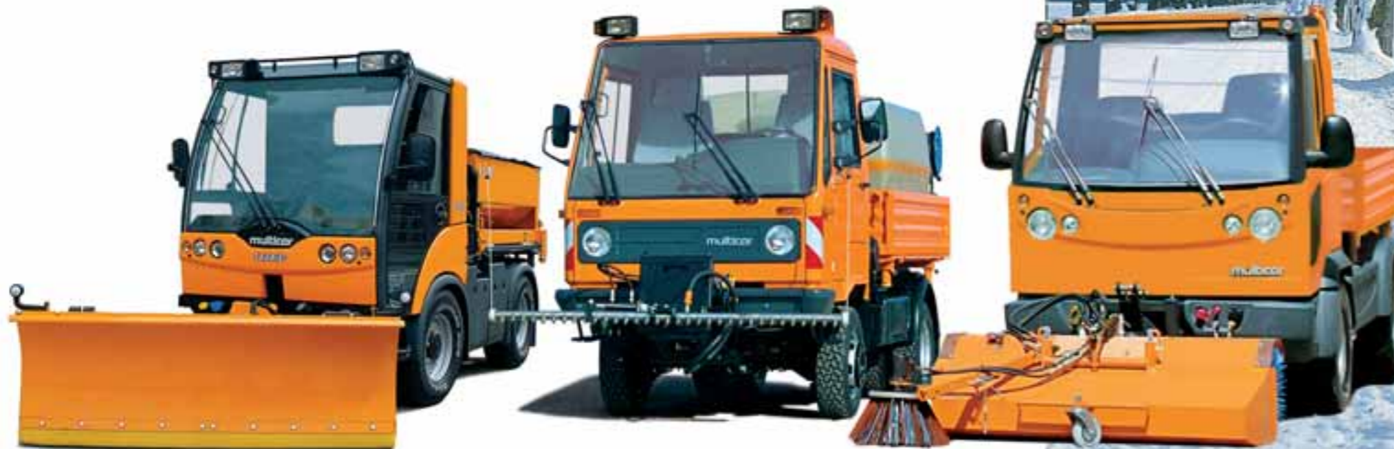
TREMO: 1.32 m wide