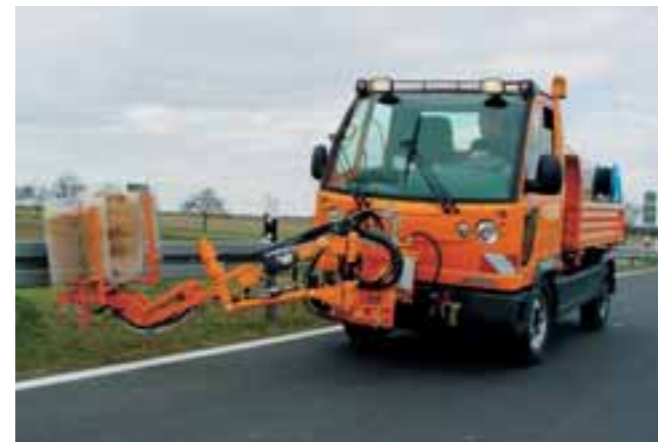
Washing marker posts and crash barriers with FUMO. Up to 30 kW hydraulic power drive implements in a powerful manner.