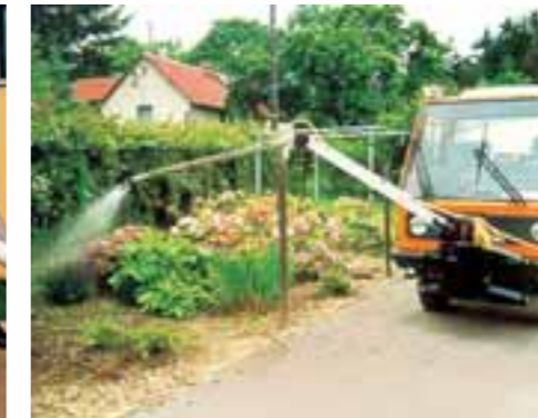
Independent from a stationary water supply, you water with the M 26 also with only 1.60 m clearance.