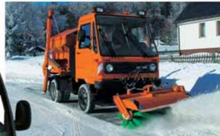
With a combination spreader on the skip loader body and a front-mounted sweeper, the M 26 masters winter tasks.

In snow and ice, the Multicar displays its real strengths. When ploughing through, when it keeps you in the track thanks to excellent traction. During snow cutting, when you steer it through the highest snow walls thanks to hydrostatic drive. During snow clearing and spreading when, thanks to its three attachment areas and powerful hydraulics, it does several things at once. During implement change when, thanks to its quickhitch system, you are back to the warm driver's cab already after a few minutes.