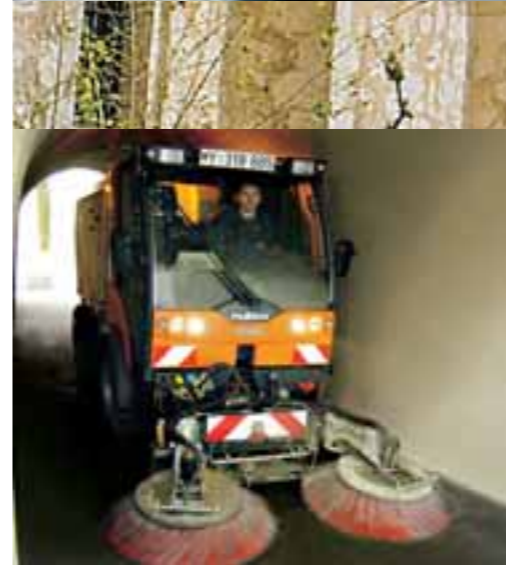
TREMO, the implement carrier, in extremely narrow sweeping use.