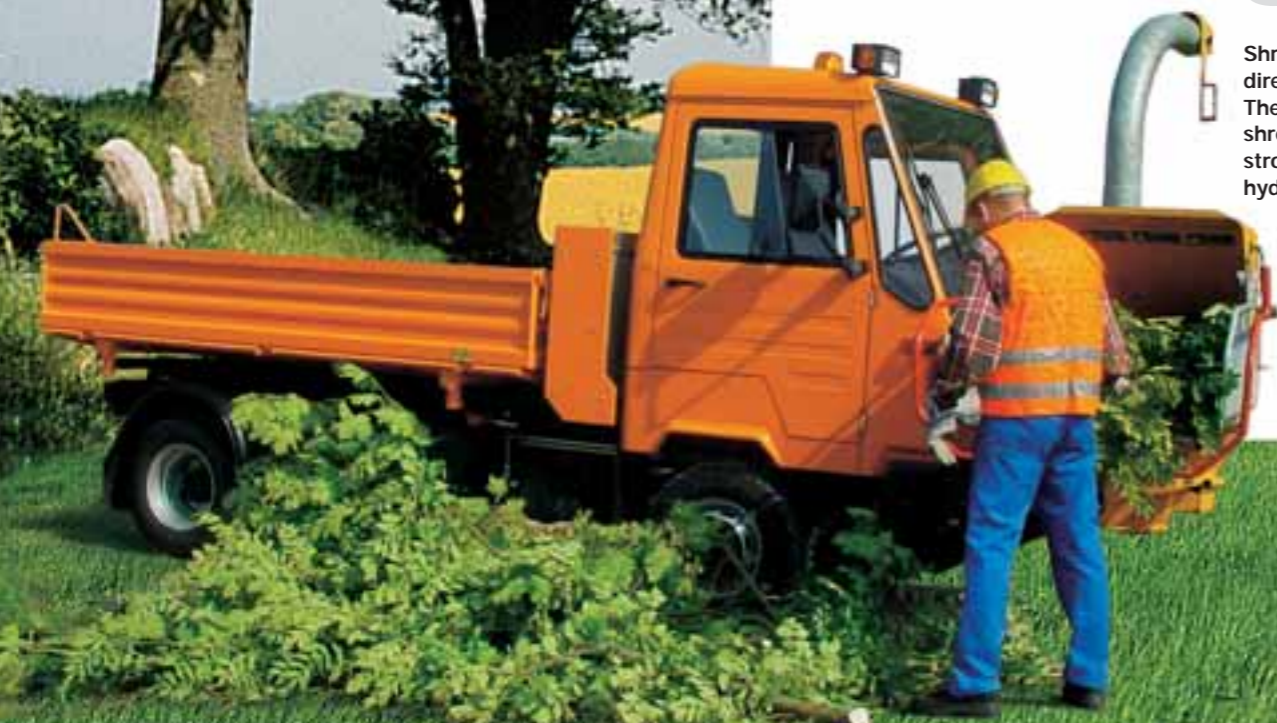
Shredding tree cuttings directly on site. The M 26 drives the shredder with its strong universal hydraulics.