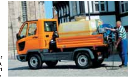
With 140 bar water pressure, FUMO rinses dirt out of the sewer.