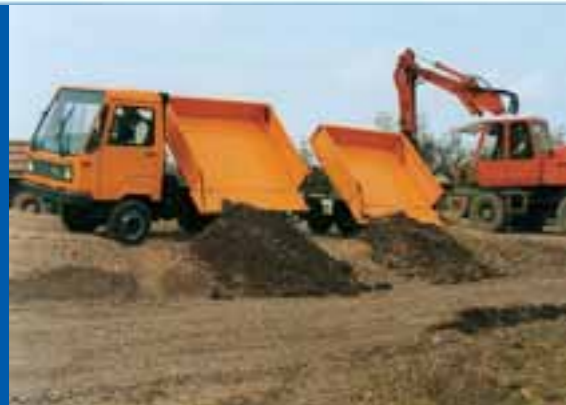
With up to 3.1 m 3 loading volume, the M 26 with long wheelbase and trailer transports on and off the road.