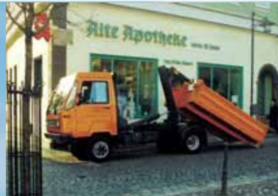
Thanks to its sturdy design and hydraulics, the M 26 with hook lift, lifts up to 2.5 t by itself in a powerful manner.