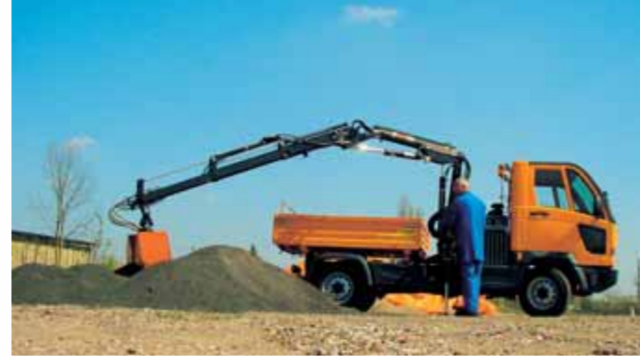
FUMO excels also where there are no roads with 4x4 all-wheel drive, excellent off-road capability and a 3-way dumper with 1.3 m 3 loading volume.

For some, it means quality of life, for others, it means a lot of work: Summer. Arranging, planting, cutting, mowing, mulching, watering, chopping and, at the same time, transporting water, sand, soil or tree cuttings. Good, when your partner is a real multi-talent and simultaneously drives implements and transports heavy loads. In other words, a genuine Multicar.