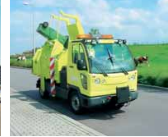
FUMO makes space: Its container takes up to 4.9 m 3 and hydraulically compresses with a ratio of 5:1.