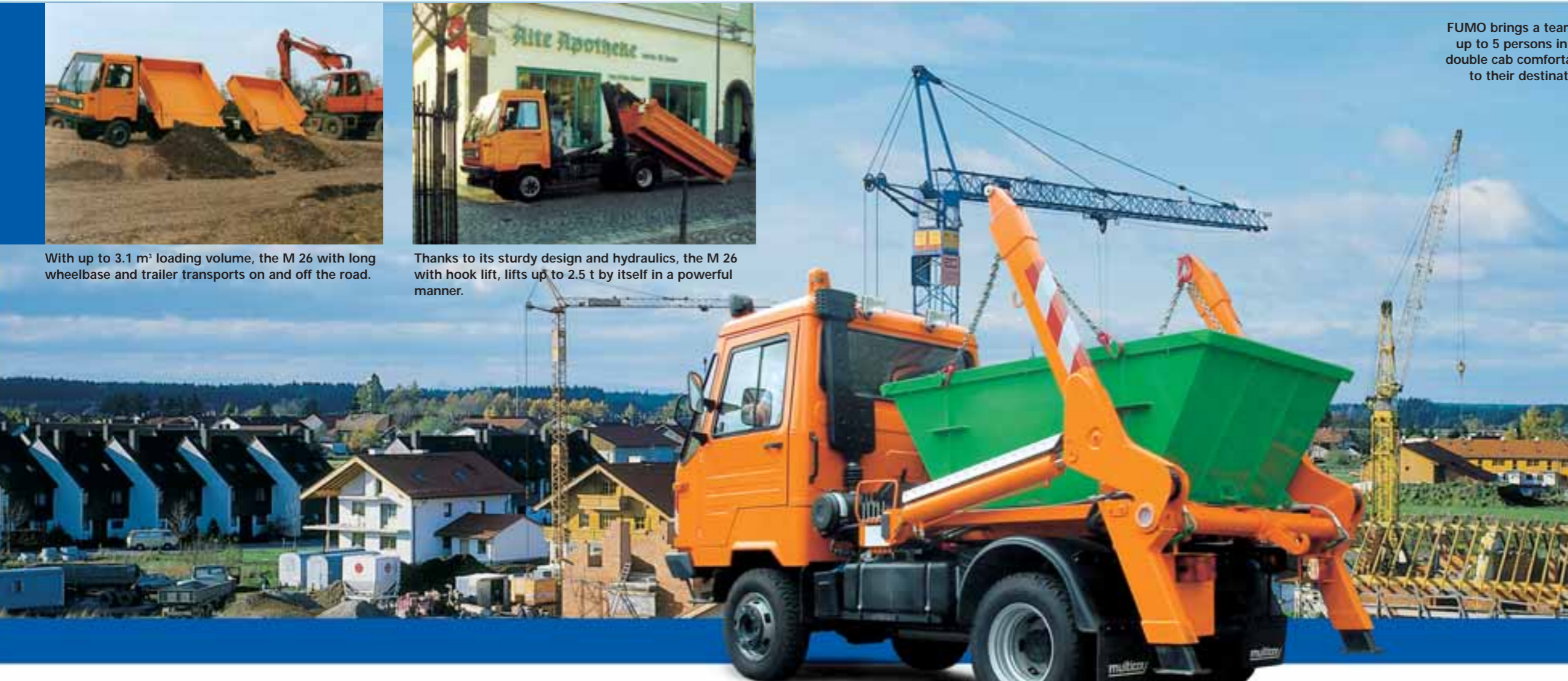
With single-circuit hydraulics and a payload of up to 2.3 t, the M 26 with skip loader also disposes of material in narrow driveways and inaccessible building sites.