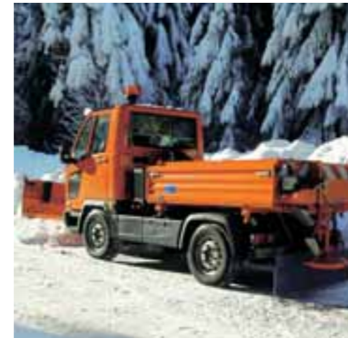
The front and rear hydraulic connections of the FUMO drive implements with up to 300 bar.