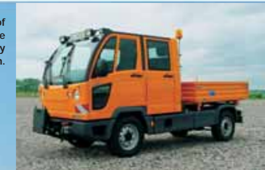
FUMO brings a team of up to 5 persons in the double cab comfortably to their destination.