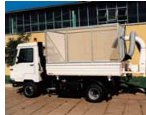
Up to 6.6 m 3 leaves are vacuumed by the M 26 with its long wheelbase into its crate attachment.