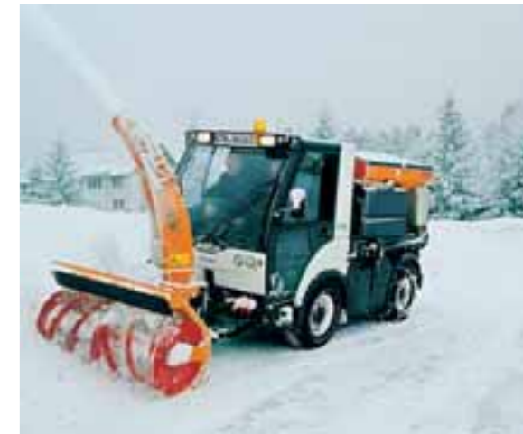
TREMO Carrier: With hydrostatic drive for snow cutter use.