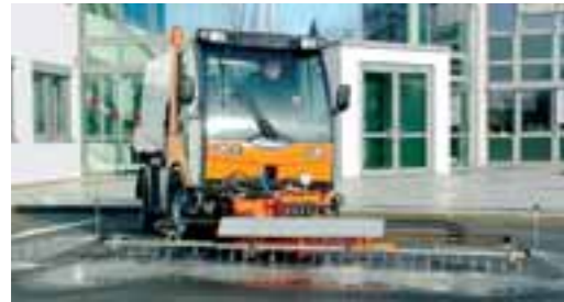
With the 1800 l tank of the TREMO Carrier, you are not dependent on a stationary water supply.

Manoeuvrable, compact and ready at all times. A Multicar is at home on all roads and bicycle paths of your town. With dimensions of approx. 1.60 m width (TREMO Carrier only 1.32 m) and approx. 2.20 m height, FUMO, M 26 and TREMO Carrier even fit on bicycle paths and through narrow archways. With their powerful engines, they join unobtrusively the flowing traffic. With their powerful brakes, they stop within the shortest time. And with approx. 5 m turning radius, they turn around the narrowest corners.